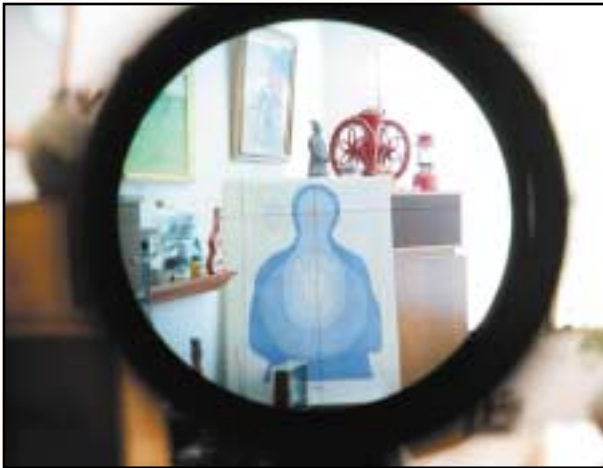
Here's a target at 7 yards inside our photographer's house, a typical CQB distance, with the Short Dot set at its lowest 1.1x power...