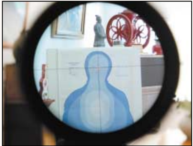
...and here it is at 4x at the same distance. Notice that at 4x, you can't see the target's hands or lower torso while the whole man is visible at 1.1x.

windage knobs from being accidentally turned. Locking turrets for both planes of adjustment were added. The Gen II Short Dots have BDC cams available for M855, M118LR16, and M118LR20.